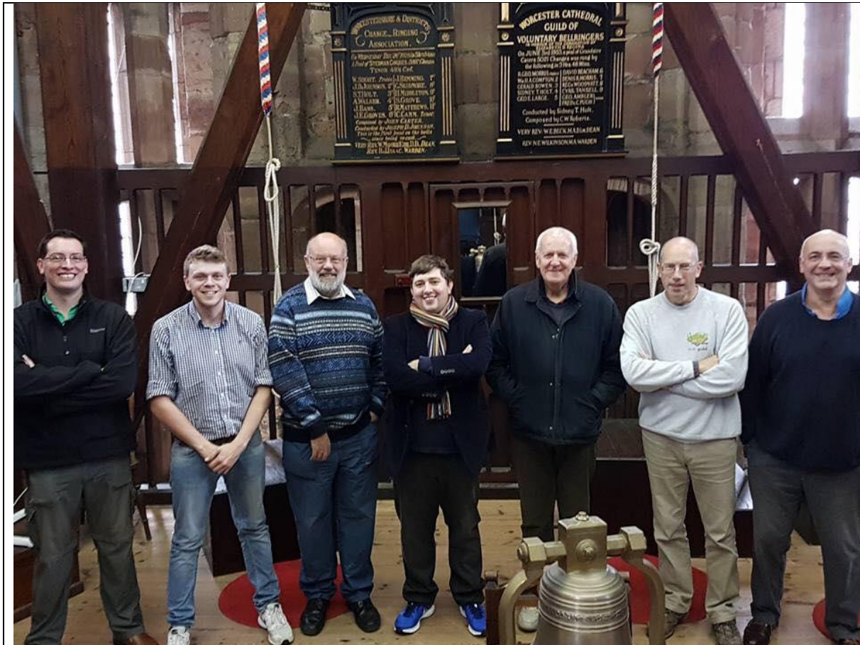
L to R with peals rung at Worcester as at 18 Feb 2017 –

It is rare for all the leading ringers to be in the same peal so on 18 Feb 2017 when the top seven happened to be together, a photo was lined up. This picture was put on Facebook in Feb 2018 and dubbed the ‘Magnificent Seven’ by Ashley Fortey.